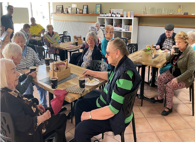
Enjoying afternoon tea at the Birchip Bakery