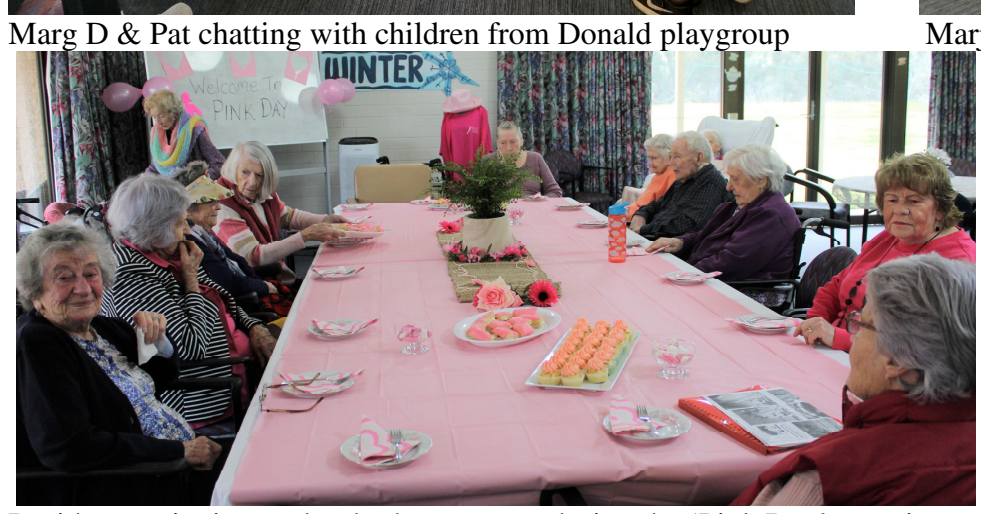
Residents enjoying each other's company during the 'Pink Day' morning tea