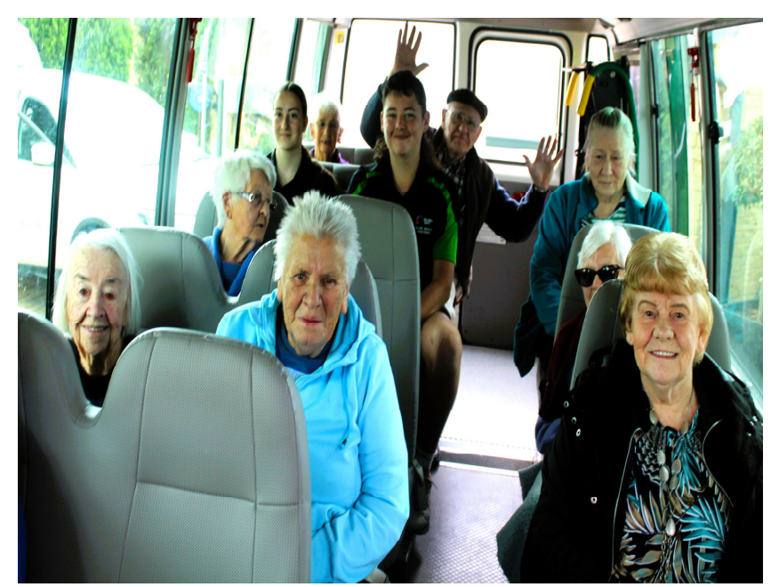
Residents & Students enjoying a bus trip to Murtoa