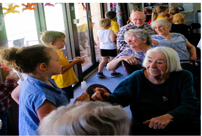
Residents speaking with the Prep circus stars!