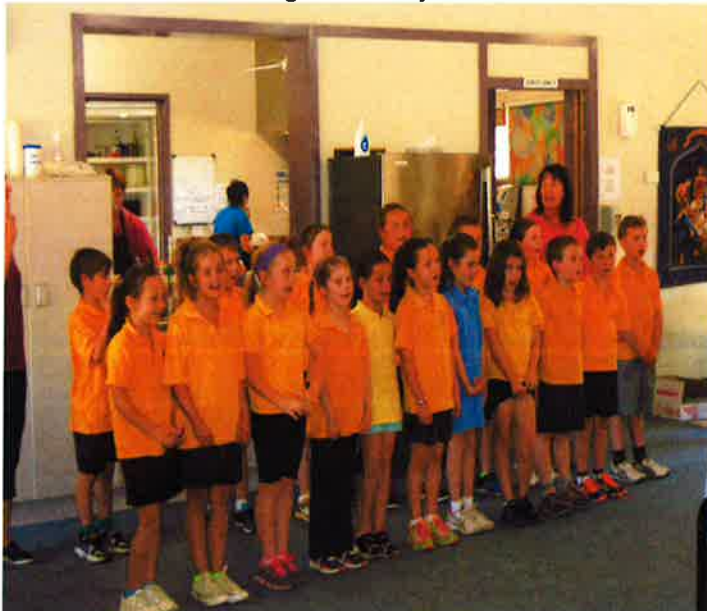
Above: Donald Primary students performing at Christmas.